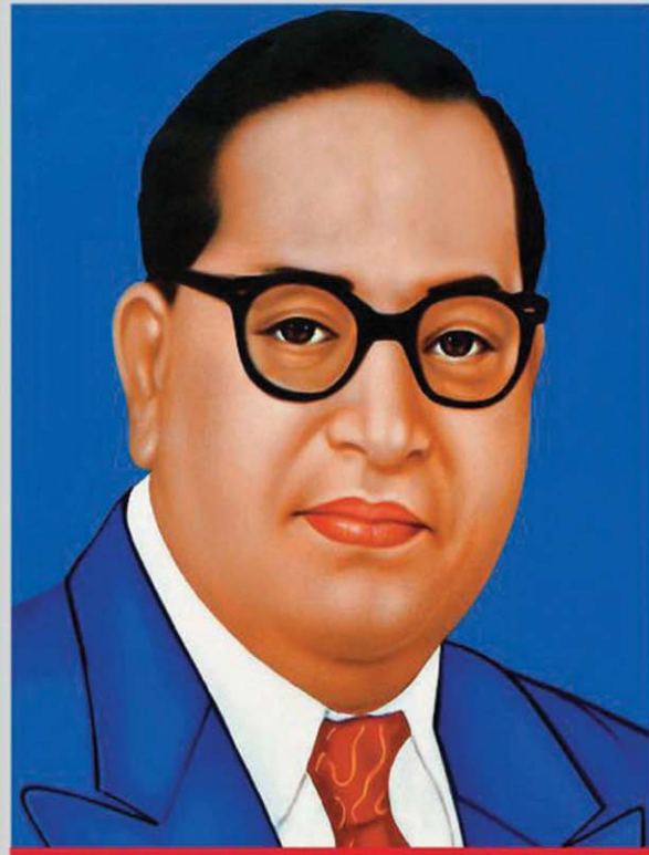
DR. B.R. AMBEDKAR