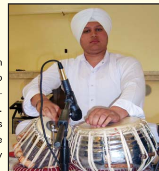
Tabla. . His gift from God, training and dedication has made him a very good musician in young age. . His performance on the stage is incredible.