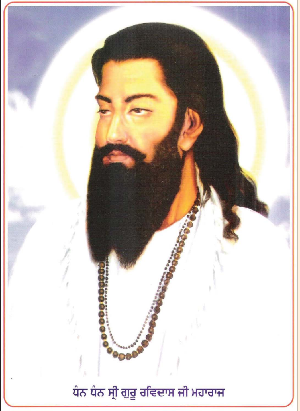
ਧੰਨ ਧੰਨ ਸ੍ਰੀ ਗੁਰੂ ਰਵਿਦਾਸ ਜੀ ਮਹਾਰਾਜ

If you have any questions or need any additional information, please call any member listed below. Thank you.