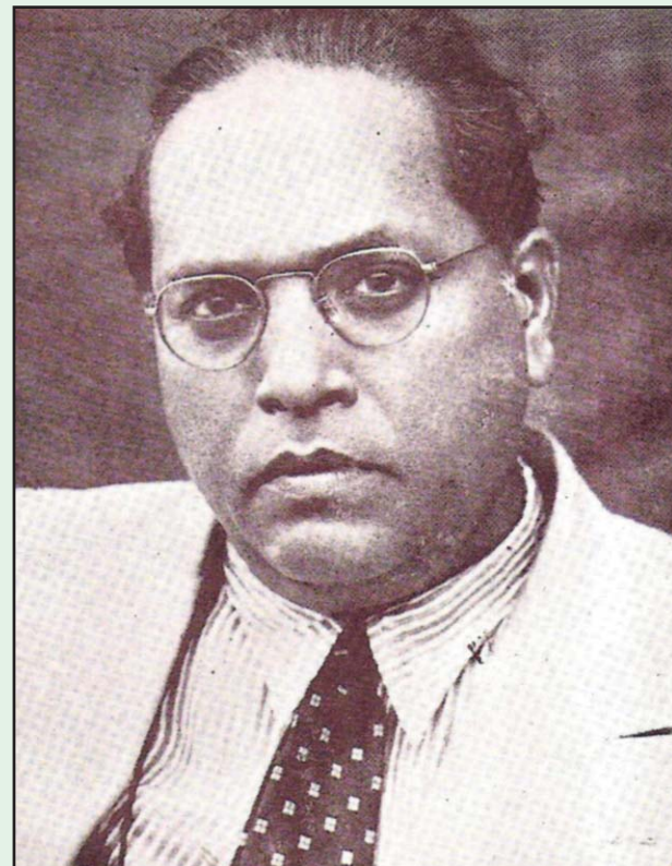
Dr. B. R. Ambedkar